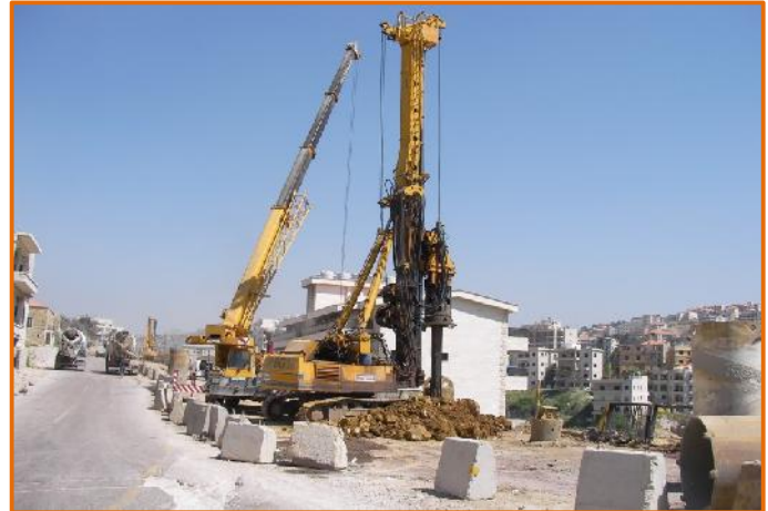
Piling operations underway in Bhamdoun